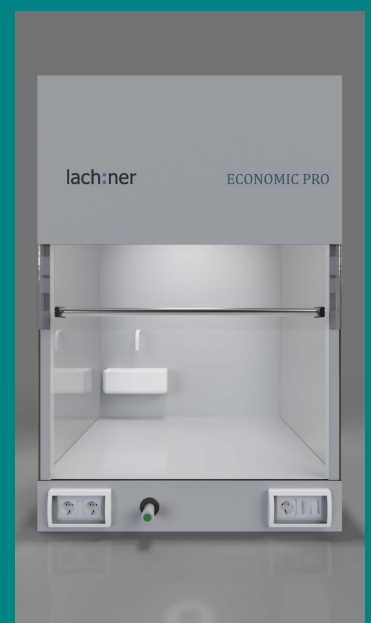
Table top fume hood with lightweight frame and chemical resistant chamber lining. Suitable for easy location change, but still with all supply options.