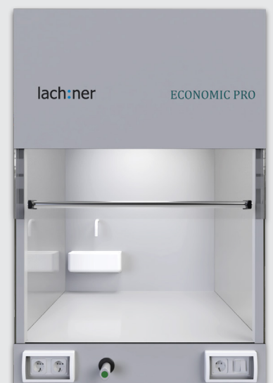
Table top fume hood with lightweight frame and chemical resistant chamber lining. Suitable for easy location change, but still with all supply options.